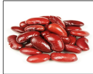
Out of Packaging